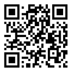
Link to AFHC documentary